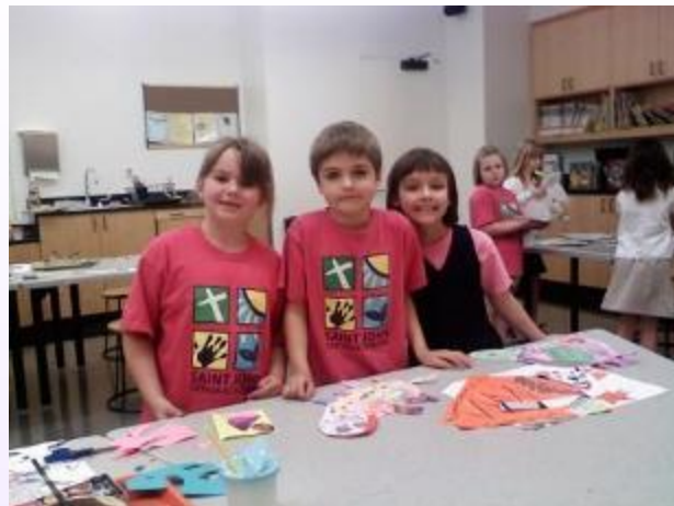
Field trip to Nelson Art Gallery in Kansas City.