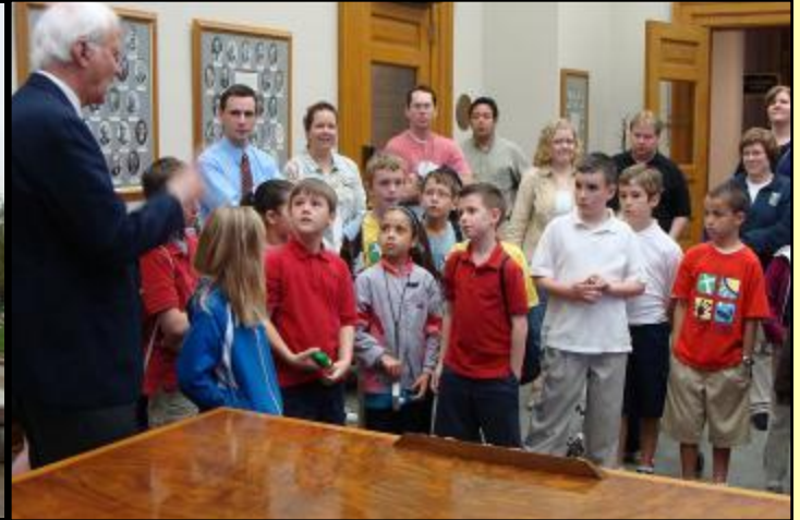
After studying the state of Kansas the third graders took their annual trip to visit the capitol building and judicial center in Topeka.