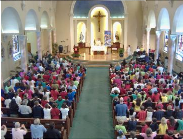
Dedication of the Sisters of Charity of Leavenworth Bench and Garden Area April 22, 2008