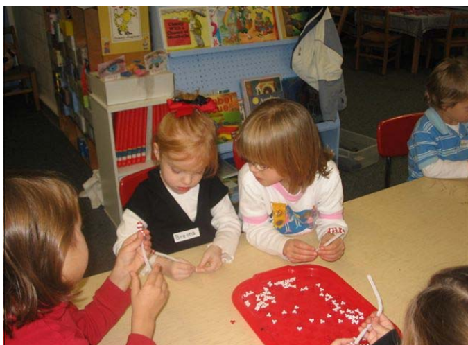
Kindergarteners and preschoolers making Christmas ornaments.