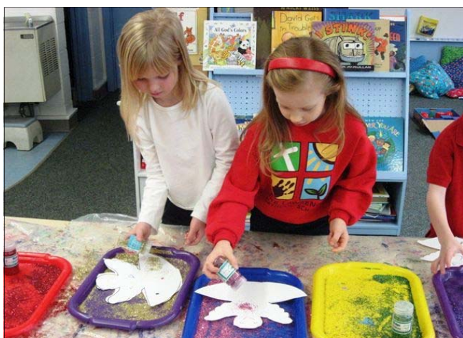
Kindergarteners making angels with glitter.