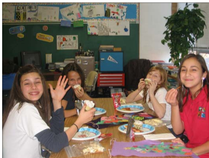
Students celebrated Christmas with parties on Dec. 20.